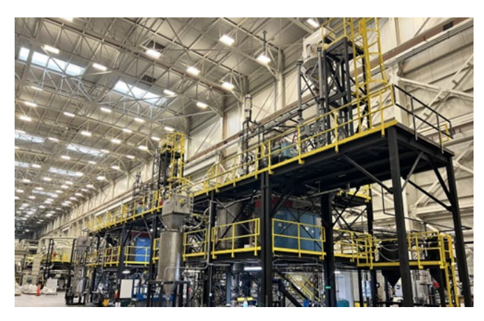
Two Generation 3 Furnace systems and milling equipment installed in NOVONIX's Riverside facility

We believe that 2024 will be a landmark year, as we look to begin to scale our anode business towards commercial production, progress our cathode synthesis business, and pursue additional capital support including through the DOE Loan Program Office."