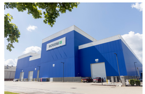
NOVONIX's Riverside facility in Chattanooga, Tennessee, poised to become the first large-scale production site dedicated to high-performance synthetic graphite for the battery, defense, and industrial sectors in North America.