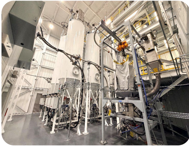
Figure 2 Blending & Finishing