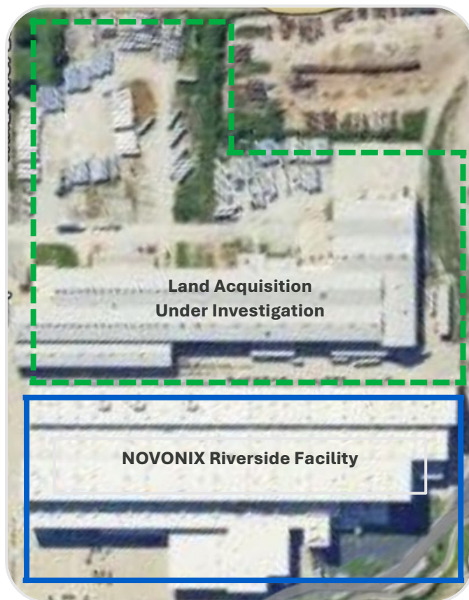
Figure 1 Adjacent land investigation

The existing plan to reach 50,000 tpa contemplates development across two separate locations in Chattanooga, namely Novonix Riverside and Novonix Enterprise South. This assessment evaluates consolidating the 50,000 tpa build-out into one unified project, which could deliver significant capital savings of more than $200 million, along with several million dollars per year in operational synergies. There is no certainty that the transaction or consolidation will proceed.