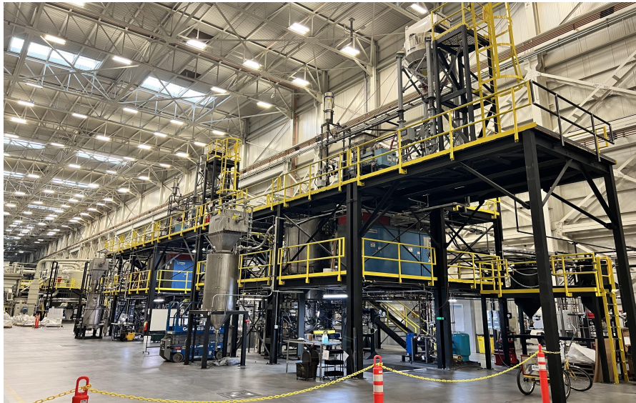
Two Generation 3 Furnace systems and milling equipment installed in NOVONIX's Riverside facility

Production campaigns have been ongoing to provide both operating data and economic insight on this breakthrough technology. In the most recent campaign, material was produced that met all specifications while also reaching the equipment design throughput targets. The Company will continue with production campaigns to collect more operational data and provide mass-production material for sampling to potential customers.