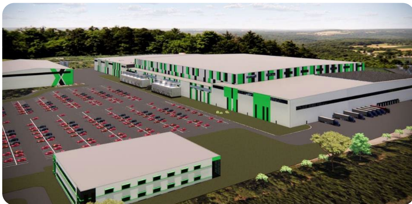
Figure 2 Proposed NOVONIX Enterprise South rendering located on 182 acres in the Enterprise South Industrial Park in Chattanooga, Tennessee.

To support growing customer demand, NOVONIX is continuing to advance plans for a second large-scale synthetic graphite facility in Chattanooga, Tennessee. In April, the Company signed a definitive agreement to purchase a 182-acre site in the Enterprise South Industrial Park, following