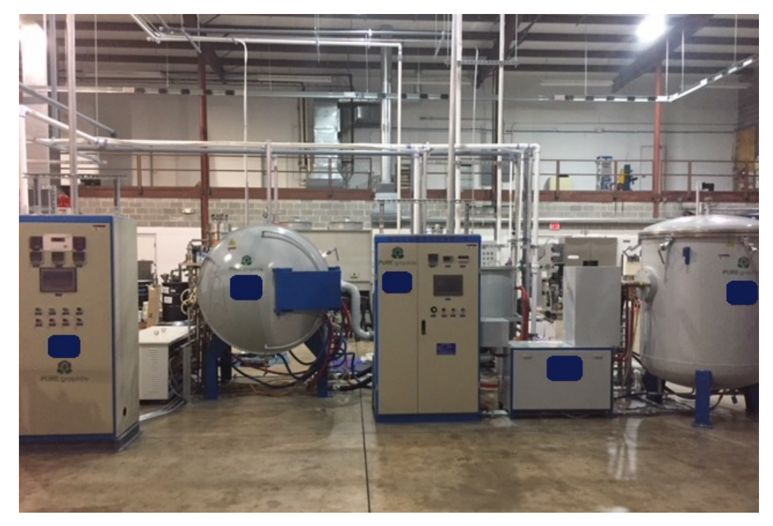
Image: Furnace Section of PUREgraphite Pilot Plant, Chattanooga, Tennessee, USA