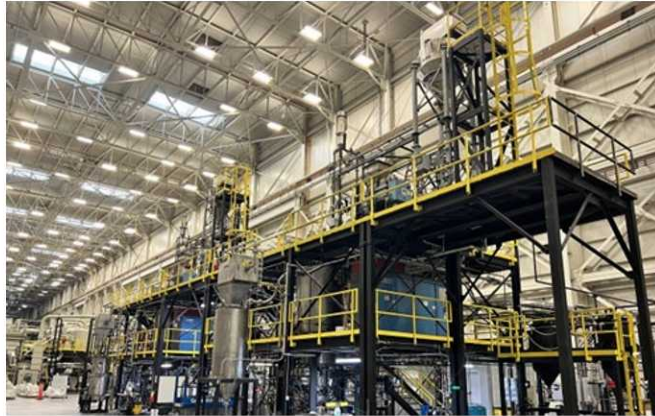
Two Generation 3 Furnace systems and milling equipment installed in NOVONIX's Riverside facility

We expect our balance sheet and cash position to support our operating expenses into 2025, at which time we anticipate our revenues to materially increase from our synthetic graphite production. We continue to pursue capital to fund our planned growth, through government programs, like the DOE MESC and DOE ATVM programs, strategic partners, and other capital sources.”