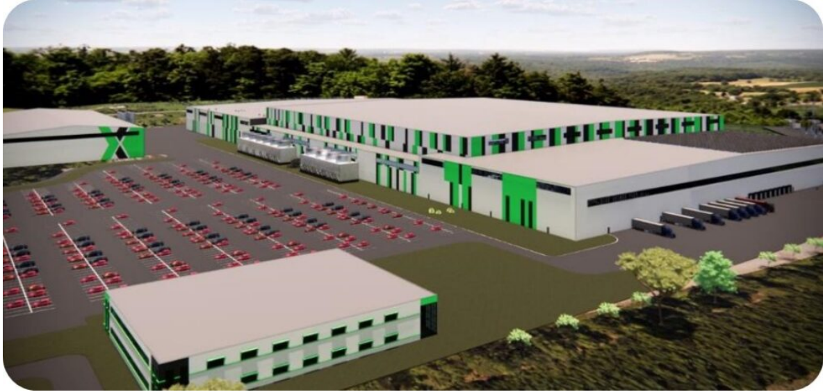
Figure 2 Site Rendering of NOVONIX Enterprise South

NOVONIX Enterprise South (NES), together with NOVONIX's existing 20,000 tpa facility at Riverside in Chattanooga, is planned to bring the Company's total production capacity to over 50,000 tpa by 2028.