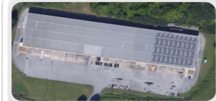
PUREgraphite - Chattanooga, Tennessee, USA 353 Corporate Place, Chattanooga, TN, 37419, USA