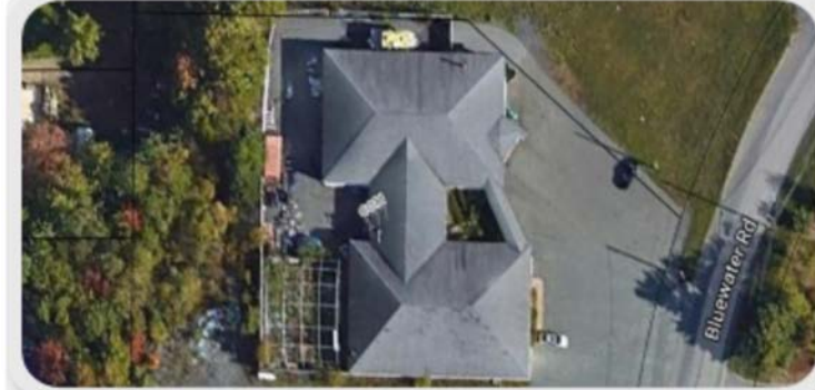
BTS - Bedford, Nova Scotia, CANADA 177 Bluewater Road, Bedford, NS B4B 1H1, Canada