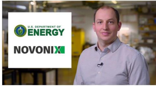
Wednesday, October 19, 2022, DOE announced that NOVONIX was selected to enter negotiations to receive US$150 Million in grant funding to support a 30,000 tonnes per annum (tpa) synthetic graphite U.S. manufacturing facility