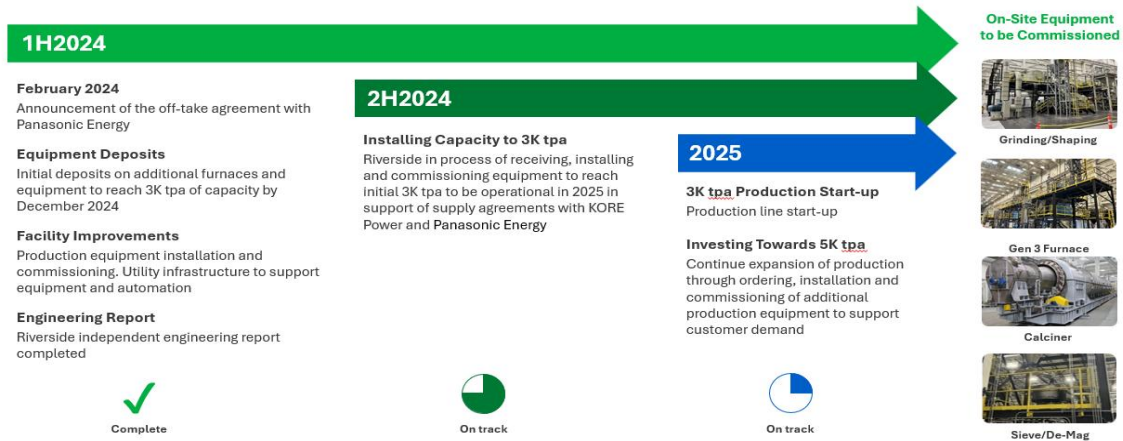
Figure 3 Path to commercial production at Riverside