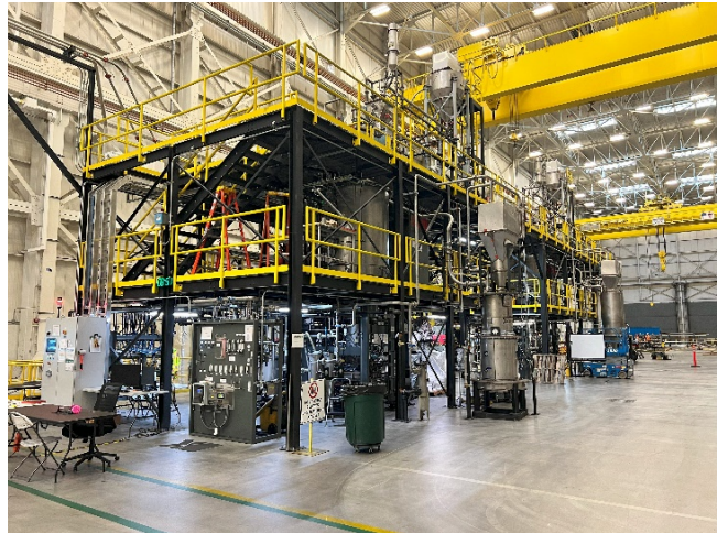
Figure 1 NOVONIX Riverside Facility, Chattanooga, Tennessee

The Company’s Riverside facility is poised to become the first large-scale production site dedicated to high-performance synthetic graphite for the battery sector in North America. It is slated to begin commercial production in late 2025 to support the Company’s offtake with Panasonic Energy and plans to grow output to 20,000 tpa to meet current customer commitments. Previously, the Company announced the MESC office of the DOE awarded the Company a US$100 million grant and selected the Company to receive a US$103 million investment 48C tax credit towards the funding of the Riverside facility. The Company also received