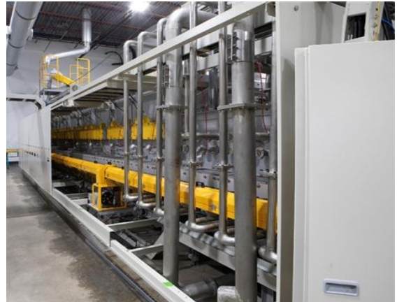
Figure 4 NOVONIX Cathode Pilot Line, Nova Scotia, Canada. 13.5 m long roller hearth kiln (RHK)

CBMM has invested US$80 million in establishing its first industrial-scale niobium oxide refining facility with the intent of providing battery makers with niobium. The facility is focused on niobium oxide applications for battery materials. The use of niobium oxide has been shown to improve the cycle life of NMC cathode materials, and it is expected to be a key material in CAM production. Before the end of 2024, CBMM aims to complete its first production from the 3,000 tpa facility.