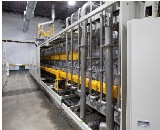
NOVONIX 13.5 m long pilot roller hearth kiln (RHK).

The Company has continued its investment in the development of its all-dry, zero-waste cathode synthesis technology. The 10 tpa pilot line is producing samples for prospective customers and partners, and is reinforcing the viability of the Company's cathode materials and technology for manufacturing purposes. In June, NOVONIX's all-dry, zero-waste cathode synthesis technology was recognized by Reuters Global Energy Transition Awards, winning the R&D Achievement category.